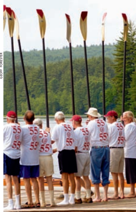
The Form of 1955 crew